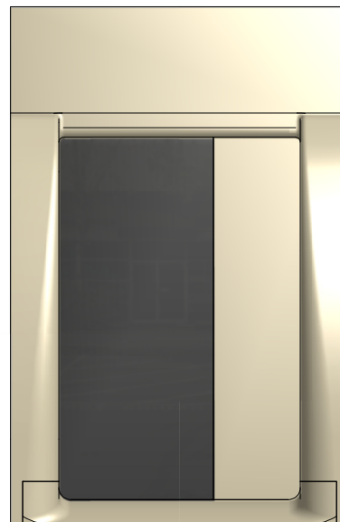
SIDE VIEW SCALE 1 / 10